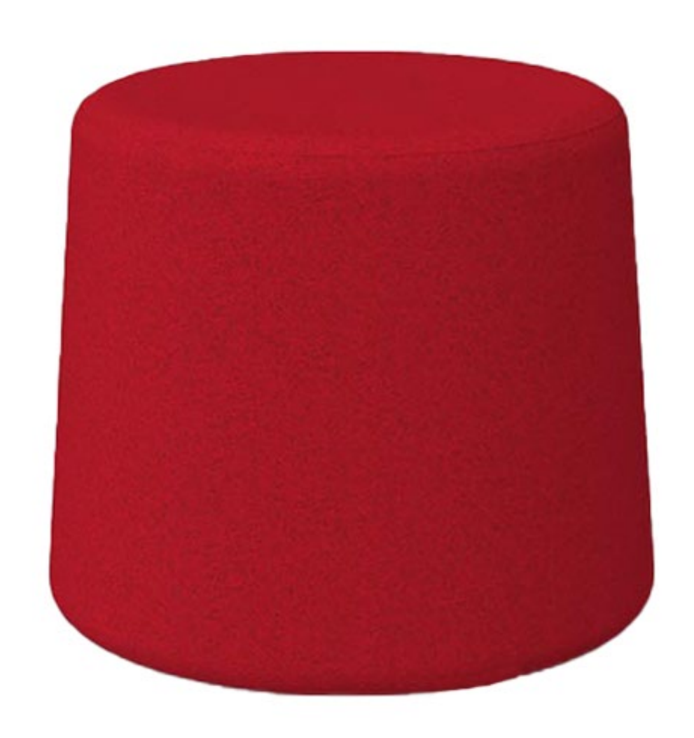
TAPPO PRODUCT DATA SPECIFICATION