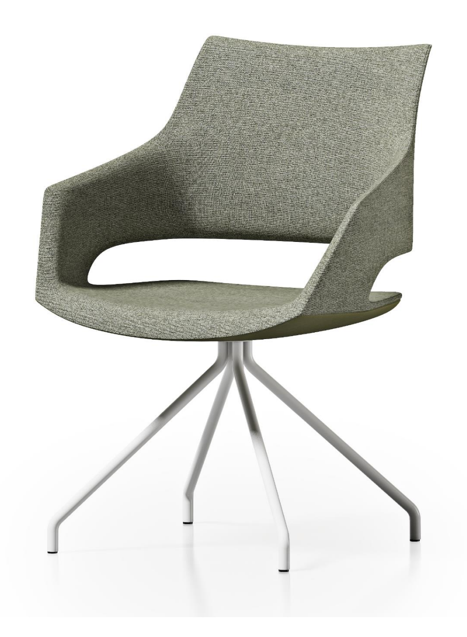
ROBUST PRODUCT DATA SPECIFICATION