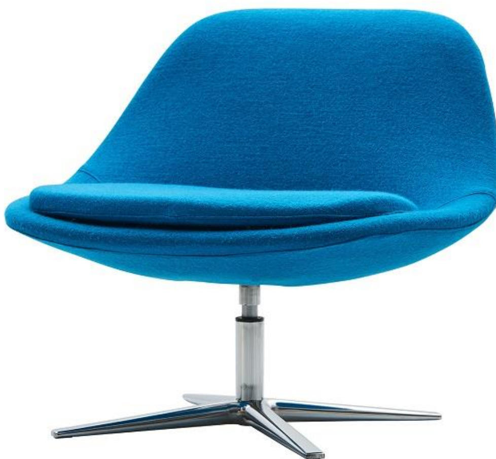
AZURE LOUNGE CHAIR - SWIVEL PRODUCT DATA SPECIFICATION