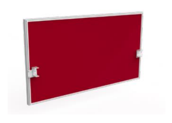
Return Screen Panel